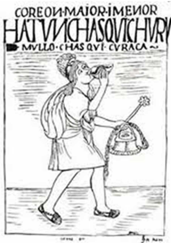
Figure 4.1 “Felipe Guaman Poma de Ayala, “Coreon Major I Menor” in El primer nueva corónica y buen gobierno (1615/1616). København, Det Kongelige Bibliotek, GKS 2232 4.